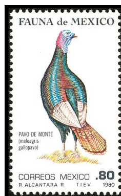
Ocellated Turkey on a Stamp of Mexico

A turkey, originally painted by John James Audubon appears on this Cinderella (not valid for postage) stamp printed by the pseudo government of exiled Haitian ex-president Jean-Claude "Baby Doc" Duvalier.